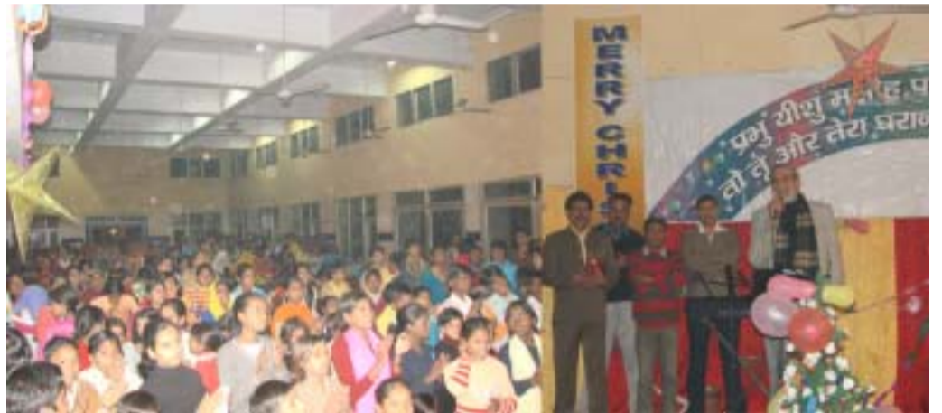
Left: Celebration in Rohini Right: Sajjan Kumar, MP speaking at the celebration