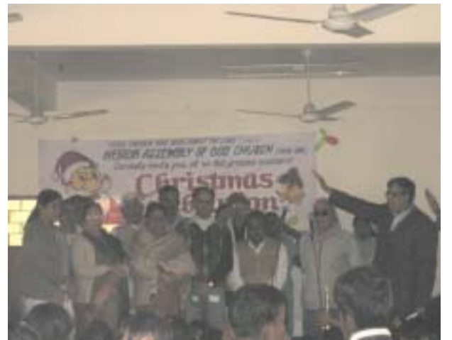
Praying for leaders at the Christmas meeting, Kamal Park

Hebron Assembly of God also conducted Christmas meetings at several places which were well attended by the local people.