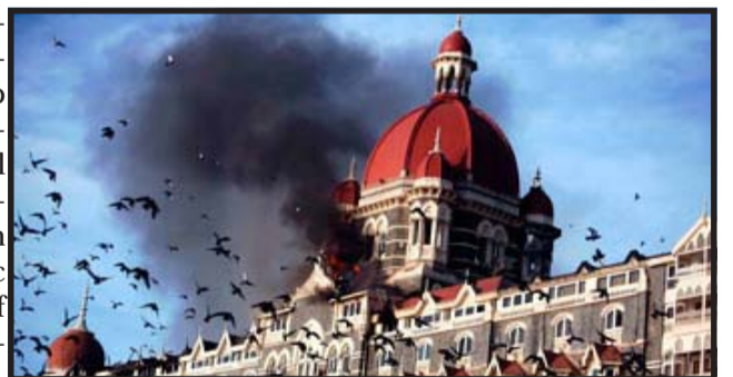
Taj hotel burning during the terrorist attack

Extending his heartfelt condolences to the relatives of those who have lost their lives in the violent attack on innocent people for no rhyme or reason, the archbishop along with other members of NUCF has offered